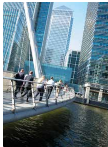
The launch event was held at the bank's Canary Wharf HQ.

In September 2017, HSBC received a Parliamentary award in recognition of the achievements of the mindfulness network. Following this success, colleagues from other parts of the world have contacted them for support in setting up their own networks.